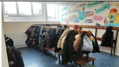
This is my new cloakroom