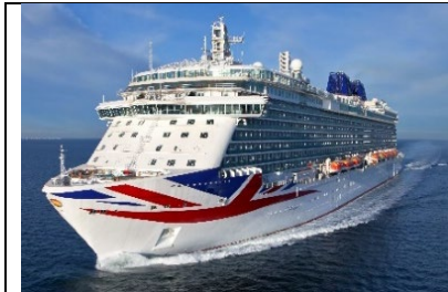
My new class is Britannia