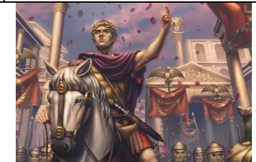
Topics I will be learning about in the autumn terms are: