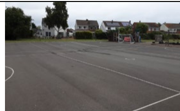
I have the same playground