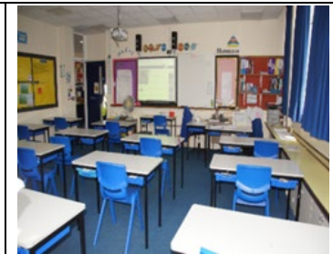
This is my new classroom