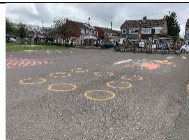
I have the same playground