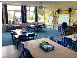
This is my new classroom