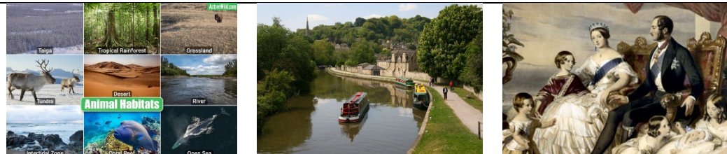
Topics I will be learning about in the autumn terms are: ○ Living things and their habitats and environments ○ UK Local investigations and patterns (South-west England including waterways) ○ Beyond living memory 1837-1901 Victorian Britain