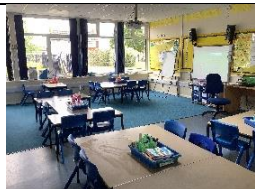
This is my new classroom