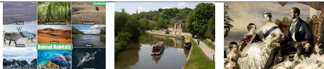
Topics I will be learning about in the autumn terms are: ○ Living things and their habitats and environments ○ UK Local investigations and patterns (South-west England including waterways) ○ Beyond living memory 1837-1901 Victorian Britain