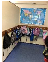
This is my new cloakroom