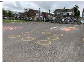
I have the same playground