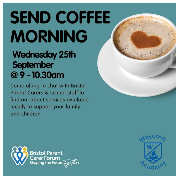
1 - SEND Coffee Morning

Wednesday 25th September at 9.00-10.30am - please come along if you would like to find out what services are available for you and your family.